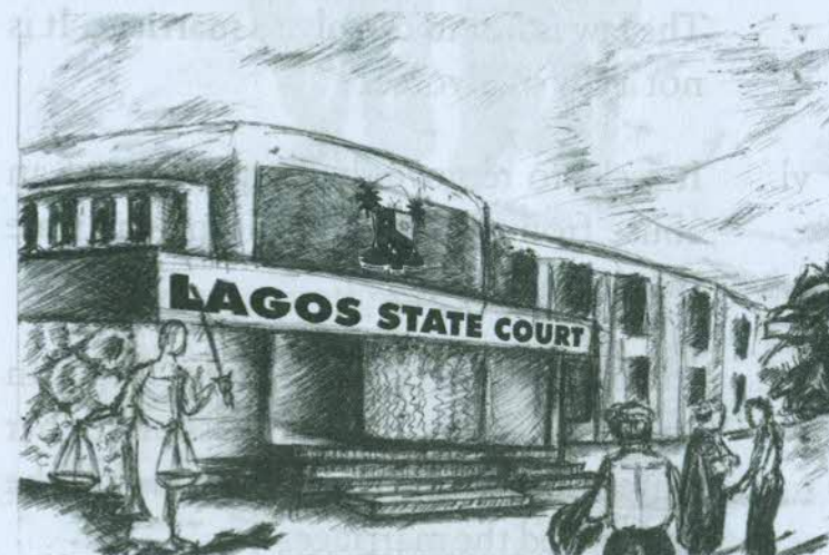
A Lagos State High Court or Magistrate Court