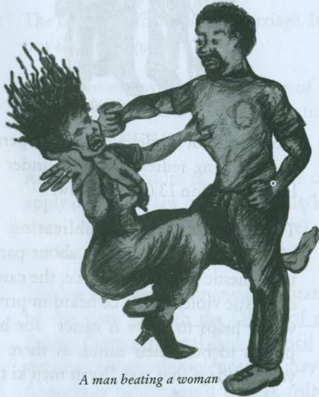
A man beating a woman

Although this law does not define “Domestic Violence”; however “Domestic Violence” can be defined in general as a “violence which occurs in the home or between people who live or have lived together” .