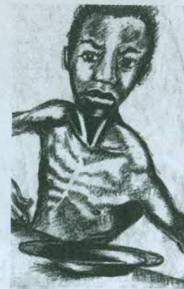
A starved child