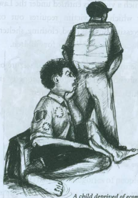
A child deprived of economic right