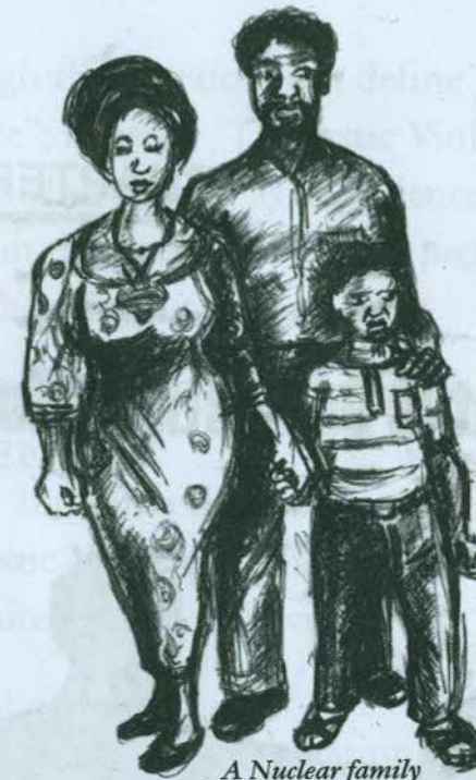
A Nuclear family