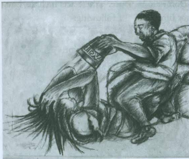
An acid bath incident